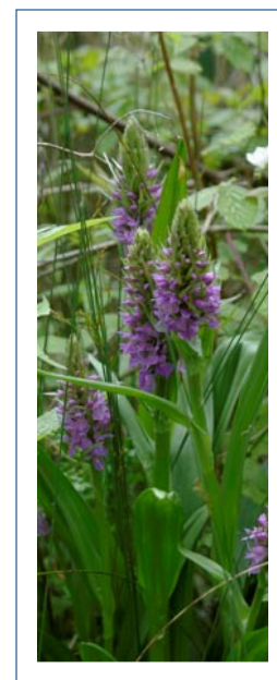
Orchids at Radley Lakes, just one of the 1,400 species so far identified

Power generation is much too important and too lucrative to allow such a small thing to stand in its way. If alternatives have to be found, they will be (if indeed they have not been already!)