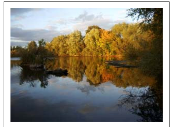
Autumn sunset at Thrupp Lake. Will this sight ever be seen again?

Remember that the animals and plants have no Member of Parliament they can write to; they can't perform sit-down strikes...they have nobody to speak for them except us, the human beings who share the world with them, but do not own it."