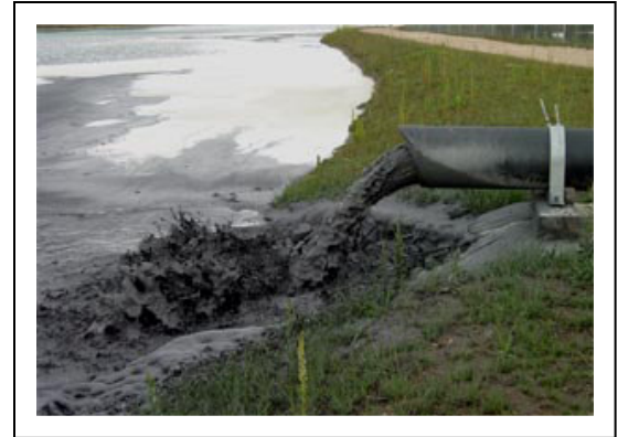
PFA slurry discharging into a lake. This is the fate that awaits Thrupp Lake

If we cannot lift a finger to save the Radley Lakes, then God help the rest of the planet!