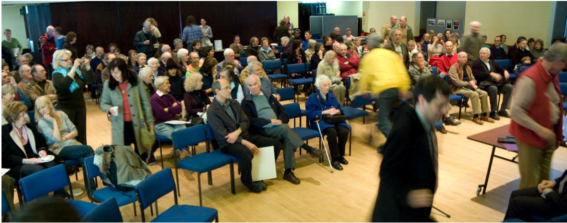
People assembling in the Guildhall before the start of the meeting.